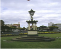
1 belcher drinking fountain geelong front view