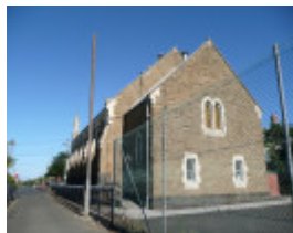
FORMER NEWTOWN METHODIST CHURCH SOHE 2008