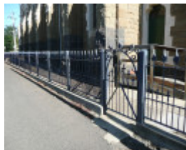
FORMER NEWTOWN METHODIST CHURCH SOHE 2008