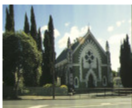
1 former newtown methodist church pakington street geelong front view aug1995