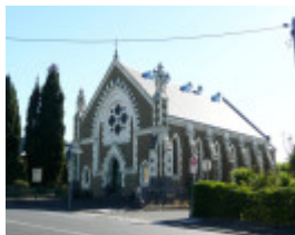
FORMER NEWTOWN METHODIST CHURCH SOHE 2008