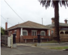
Former Malvern Dairy