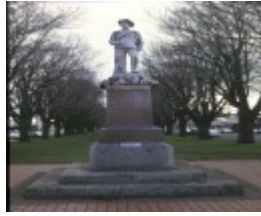
finlay ave of elms precinct camperdown empire war memorial