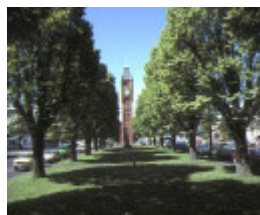
finlay ave of elms precinct camperdown avenue view