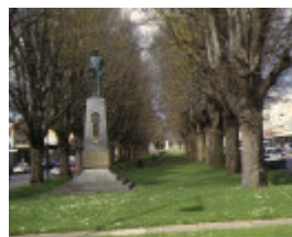
1 finlay ave of elms precinct camperdown j c manifold monument & ave of elms