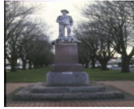
finlay ave of elms precinct camperdown empire war memorial