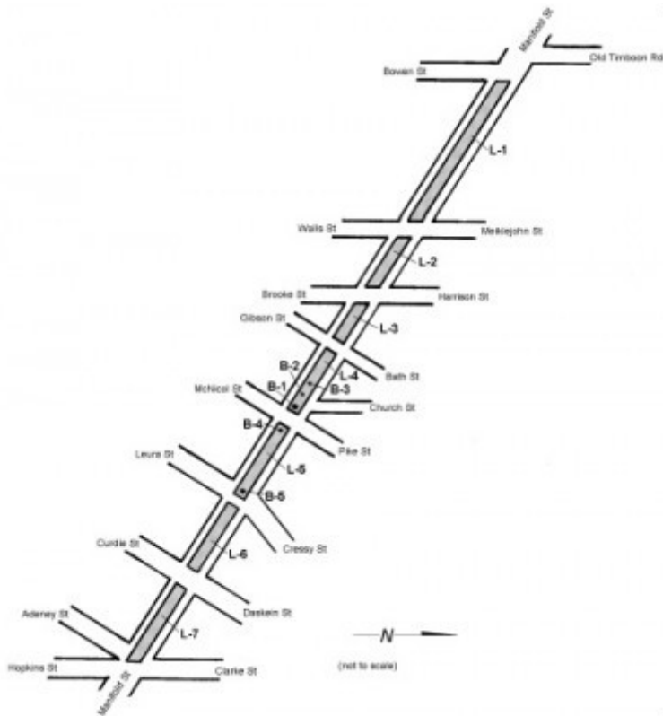
finlay avenue of elms manifold tower and monuments registration plan