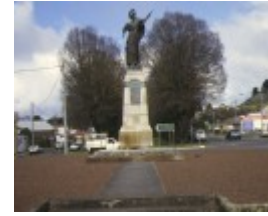
finlay ave of elms precinct camperdown soldier's memorial