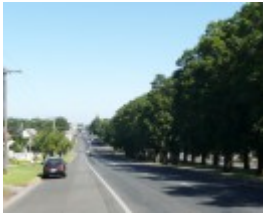
FINLAY AVENUE OF ELMS, MANIFOLD CLOCK TOWER AND PUBLIC MONUMENT PRECINCT SOHE 2008