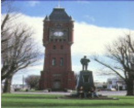
finlay ave of elms precinct camperdown view of clock tower