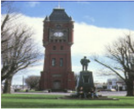
finlay ave of elms precinct camperdown view of clock tower