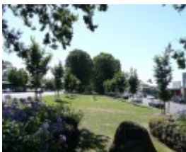
FINLAY AVENUE OF ELMS, MANIFOLD CLOCK TOWER AND PUBLIC MONUMENT PRECINCT SOHE 2008