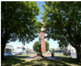
FINLAY AVENUE OF ELMS, MANIFOLD CLOCK TOWER AND PUBLIC MONUMENT PRECINCT SOHE 2008