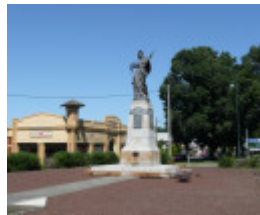
FINLAY AVENUE OF ELMS, MANIFOLD CLOCK TOWER AND PUBLIC MONUMENT PRECINCT SOHE 2008