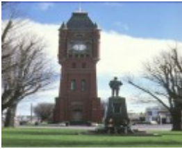
finlay ave of elms precinct camperdown view of clock tower