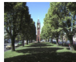
finlay ave of elms precinct camperdown avenue view