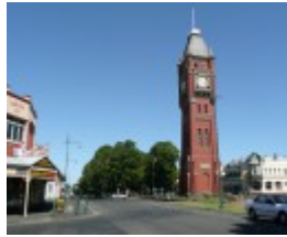
FINLAY AVENUE OF ELMS, MANIFOLD CLOCK TOWER AND PUBLIC MONUMENT PRECINCT SOHE 2008