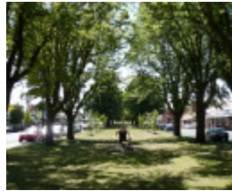
FINLAY AVENUE OF ELMS, MANIFOLD CLOCK TOWER AND PUBLIC MONUMENT PRECINCT SOHE 2008