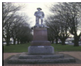
finlay ave of elms precinct camperdown empire war memorial