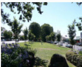
FINLAY AVENUE OF ELMS, MANIFOLD CLOCK TOWER AND PUBLIC MONUMENT PRECINCT SOHE 2008