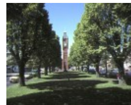
finlay ave of elms precinct camperdown avenue view