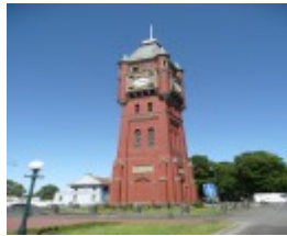
FINLAY AVENUE OF ELMS, MANIFOLD CLOCK TOWER AND PUBLIC MONUMENT PRECINCT SOHE 2008