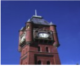
finlay ave of elms precinct camperdown detail of clock tower