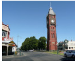
FINLAY AVENUE OF ELMS, MANIFOLD CLOCK TOWER AND PUBLIC MONUMENT PRECINCT SOHE 2008