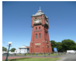
FINLAY AVENUE OF ELMS, MANIFOLD CLOCK TOWER AND PUBLIC MONUMENT PRECINCT SOHE 2008