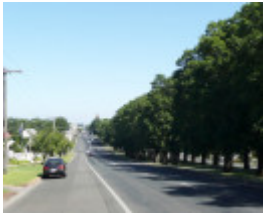
FINLAY AVENUE OF ELMS, MANIFOLD CLOCK TOWER AND PUBLIC MONUMENT PRECINCT SOHE 2008