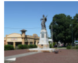
FINLAY AVENUE OF ELMS, MANIFOLD CLOCK TOWER AND PUBLIC MONUMENT PRECINCT SOHE 2008