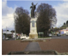
finlay ave of elms precinct camperdown soldier's memorial