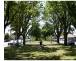
FINLAY AVENUE OF ELMS, MANIFOLD CLOCK TOWER AND PUBLIC MONUMENT PRECINCT SOHE 2008