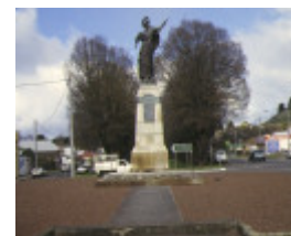
finlay ave of elms precinct camperdown soldier's memorial