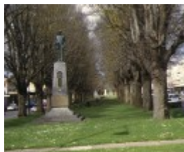
1 finlay ave of elms precinct camperdown j c manifold monument & ave of elms