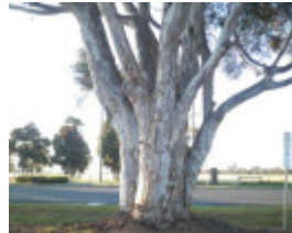
T12202 Eucalyptus cladocalyx