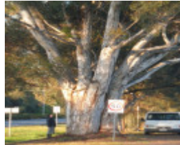
T12202 Eucalyptus cladocalyx