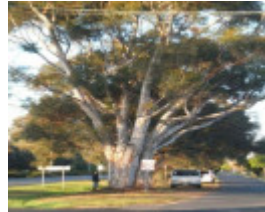
T12202 Eucalyptus cladocalyx