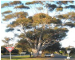
T12202 Eucalyptus cladocalyx