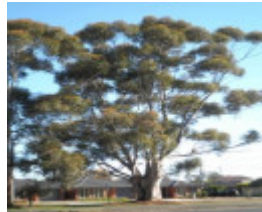
T12202 Eucalyptus cladocalyx