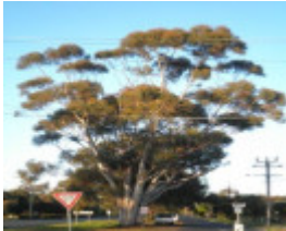
T12202 Eucalyptus cladocalyx