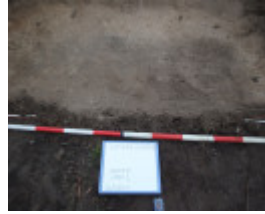
Creswick Cemetery Heritage Victoria Dig 20 May 2013