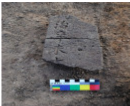
Creswick Cemetery Heritage Victoria Dig 20 May 2013