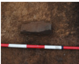
Creswick Cemetery Heritage Victoria Dig 20 May 2013