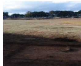
Creswick Cemetery Heritage Victoria Dig 20 May 2013