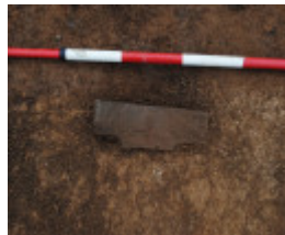
Creswick Cemetery Heritage Victoria Dig 20 May 2013