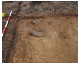
Creswick Cemetery Heritage Victoria Dig 20 May 2013