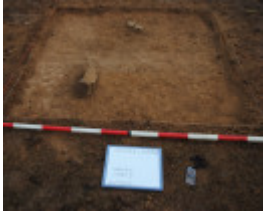
Creswick Cemetery Heritage Victoria Dig 20 May 2013