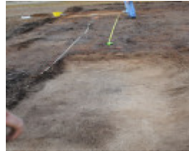
Creswick Cemetery Heritage Victoria Dig 20 May 2013