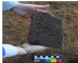
Creswick Cemetery Heritage Victoria Dig 20 May 2013