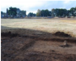
Creswick Cemetery Heritage Victoria Dig 20 May 2013