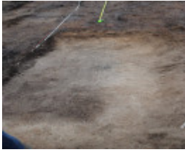
Creswick Cemetery Heritage Victoria Dig 20 May 2013