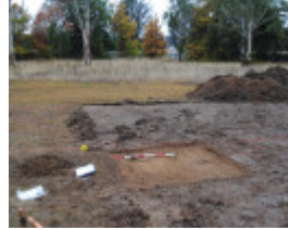
Creswick Cemetery Heritage Victoria Dig 20 May 2013