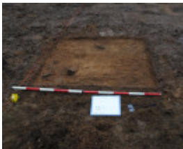
Creswick Cemetery Heritage Victoria Dig 20 May 2013