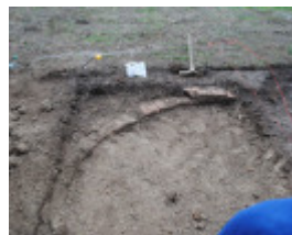
Creswick Cemetery Heritage Victoria Dig 20 May 2013