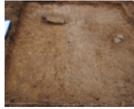
Creswick Cemetery Heritage Victoria Dig 20 May 2013