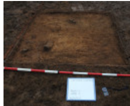
Creswick Cemetery Heritage Victoria Dig 20 May 2013