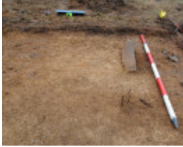
Creswick Cemetery Heritage Victoria Dig 20 May 2013