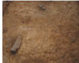
Creswick Cemetery Heritage Victoria Dig 20 May 2013