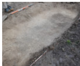
Creswick Cemetery Heritage Victoria Dig 20 May 2013