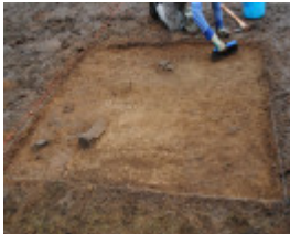
Creswick Cemetery Heritage Victoria Dig 20 May 2013