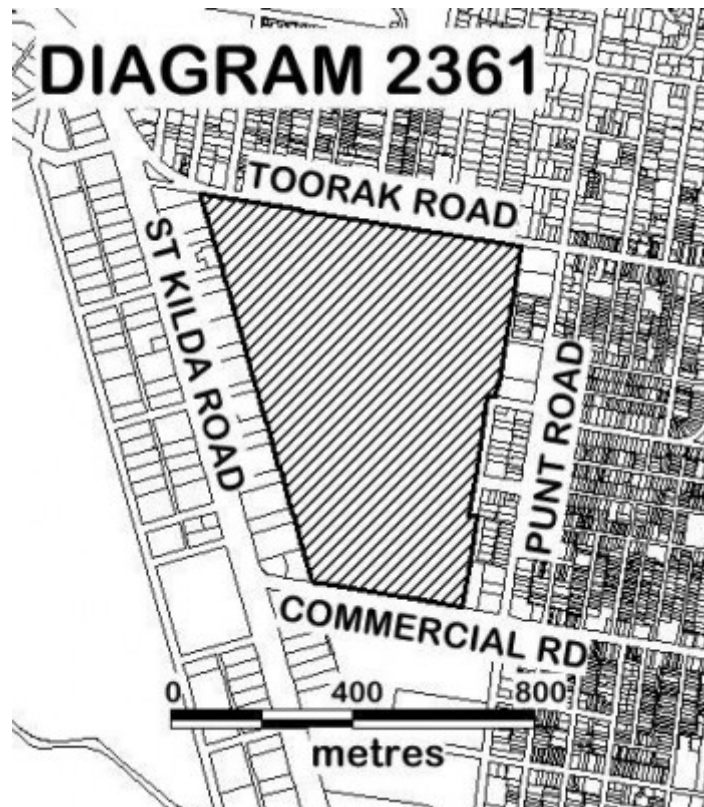
Fawkes Park Extent Diagram 2361