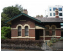
fawkner park caretakers cottage2 apr07 jmb