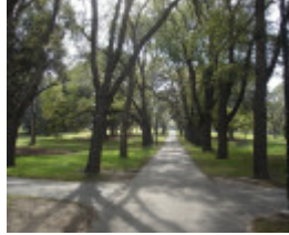
fawkner park avenue of trees2 apr07 jmb