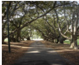
fawkner park moreton bay fig tree avenue apr07 jmb