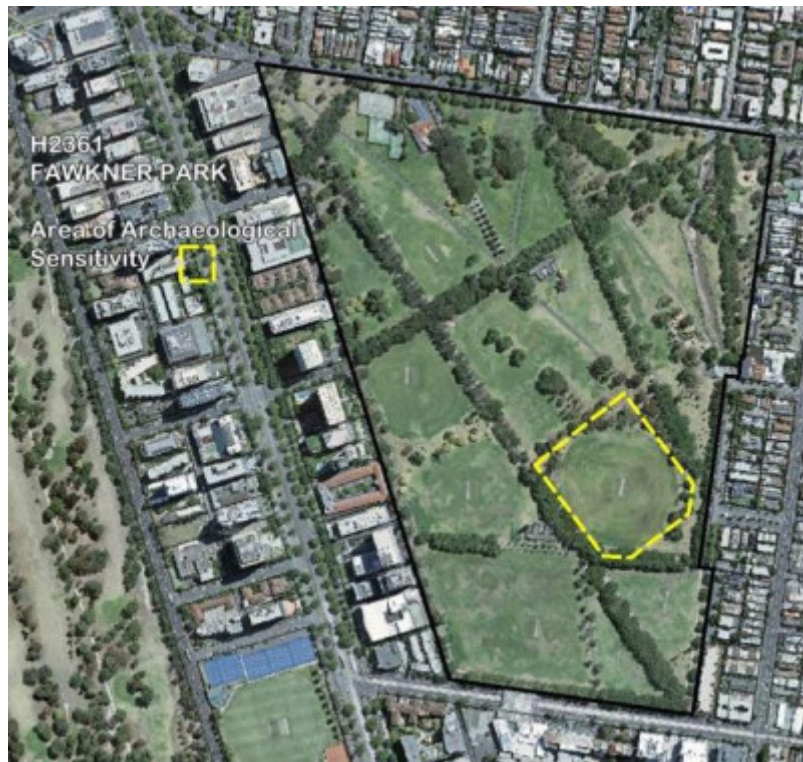
Diagram of Archaeological Sensitivity