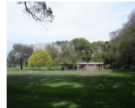
fawkner park central pavilion apr07 jmb