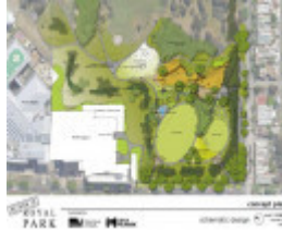
return to royal park concept plan.jpg