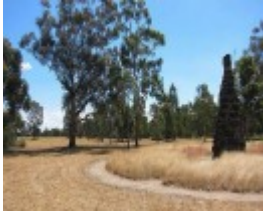
rp The Burke & Wills monument and the nearby natural landscape