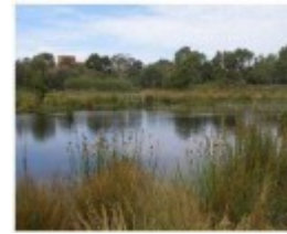
rp ross straw baseball field