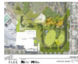
return to royal park concept plan.jpg