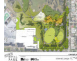
return to royal park concept plan.jpg