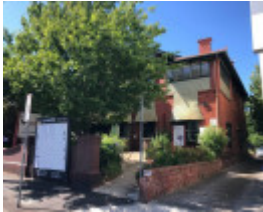
274 High Street, Windsor (2).jpeg