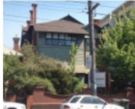
274 High Street, Windsor