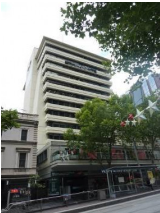
FORMER HOYTS CINEMA CENTRE 2014