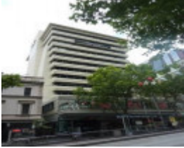
FORMER HOYTS CINEMA CENTRE 2014