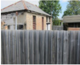
Combermere Street 47 (Aberfeldie house Stables), Aberfeldie (1).JPG