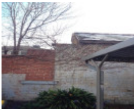
Aberfeldie House Stables