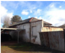
Aberfeldie House Stables