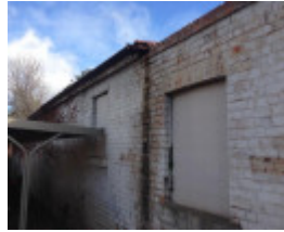
Aberfeldie House Stables