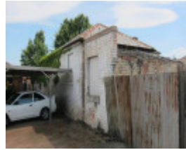
Combermere Street 47 (Aberfeldie house Stables), Aberfeldie (2).JPG