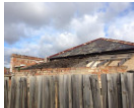
Aberfeldie House Stables