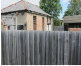
Combermere Street 47 (Aberfeldie house Stables), Aberfeldie (1).JPG