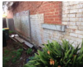
Aberfeldie House Stables