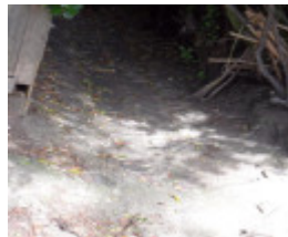
Brisbane St drain b