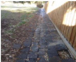
Bluestone drain Brisbane St and Ormond Rd