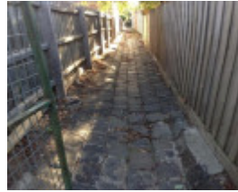
Bluestone drain Brisbane St and Ormond Rd