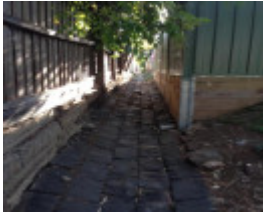
Bluestone drain Brisbane St and Ormond Rd