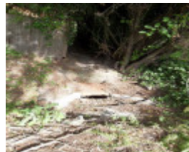
Brisbane St drain a