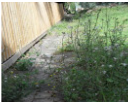
Brisbane St drain c