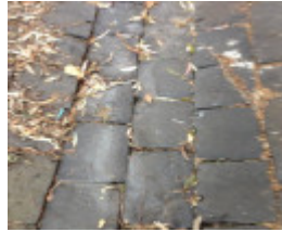
Bluestone drain Brisbane St and Ormond Rd