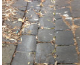
Bluestone drain Brisbane St and Ormond Rd