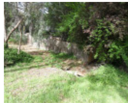
Brisbane St drain d