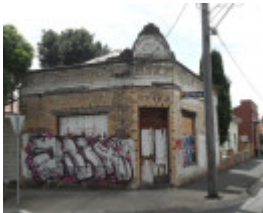
116 The Parade