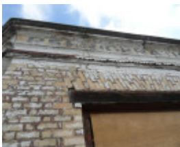
116 The Parade