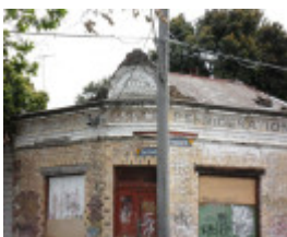
The Parade 116 b