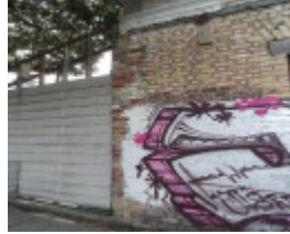
116 The Parade