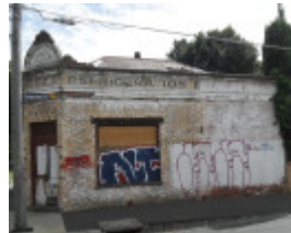
116 The Parade