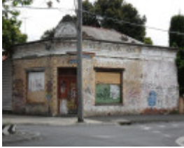
The Parade 116 a