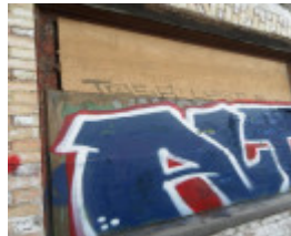
116 The Parade