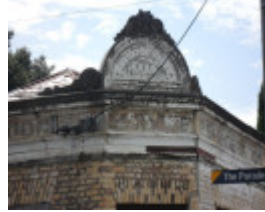
116 The Parade