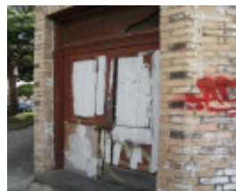
116 The Parade