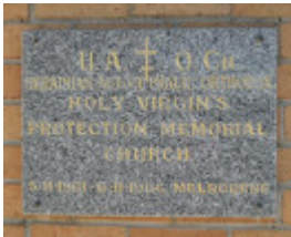
Ukrainian Orthodox Church