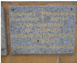
Ukrainian Orthodox Church