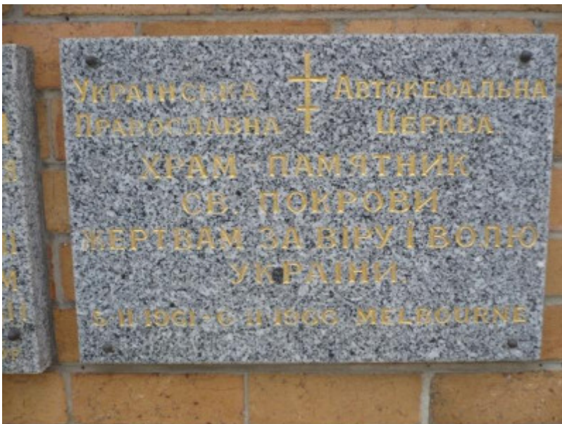
Ukrainian Orthodox Church