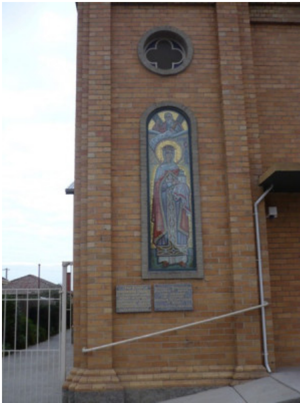
Ukrainian Orthodox Church