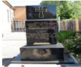
Ukrainian Orthodox Church famine memorial