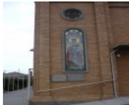
Ukrainian Orthodox Church