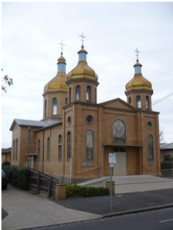
Ukrainian Orthodox Church