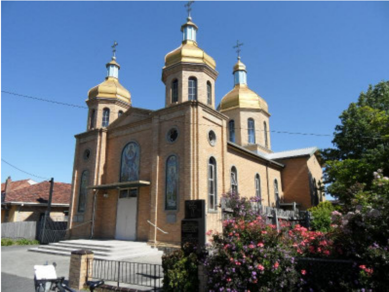
Ukrainian Orthodox Church