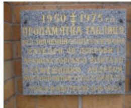
Ukrainian Orthodox Church memorial plaque