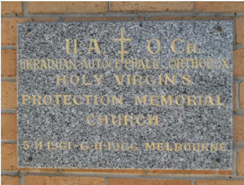
Ukrainian Orthodox Church