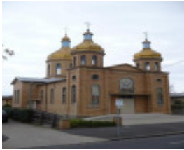
Ukrainian Orthodox Church