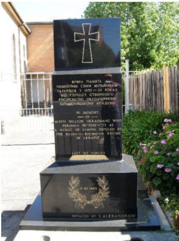
Ukrainian Orthodox Church famine memorial