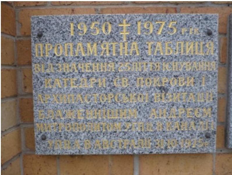
Ukrainian Orthodox Church memorial plaque