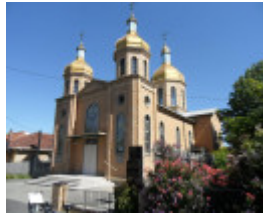
Ukrainian Orthodox Church