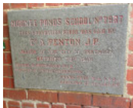
Moonee Ponds Primary School