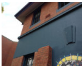
Moonee Ponds Primary School