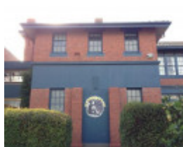
Moonee Ponds Primary School