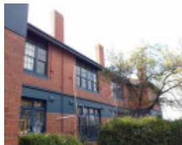
Moonee Ponds Primary School