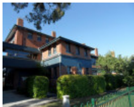
Moonee Ponds Primary School