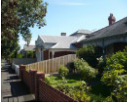
Margaret Street and Park Street