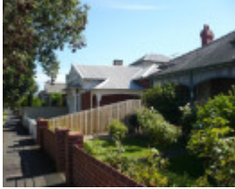
Margaret Street and Park Street