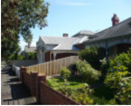
Margaret Street and Park Street