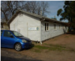
196487 f RAAF Base & Migrant Centre Benalla May 2015.JPG