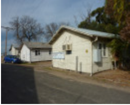
196487 f RAAF Base & Migrant Centre Benalla May 2015.JPG