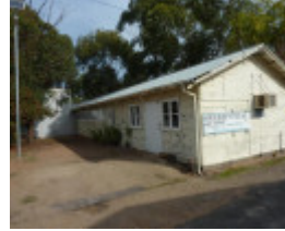
196487 f RAAF Base & Migrant Centre Benalla May 2015.JPG