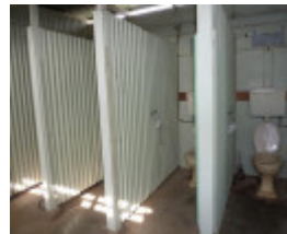
196487 f RAAF Base & Migrant Centre Benalla May 2015.JPG