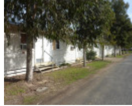
196487 f RAAF Base & Migrant Centre Benalla May 2015.JPG