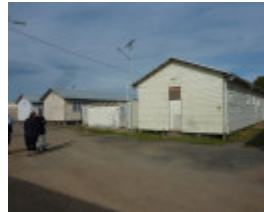
196487 f RAAF Base & Migrant Centre Benalla May 2015.JPG