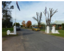
196487 f RAAF Base & Migrant Centre Benalla May 2015.JPG