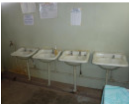
196487 f RAAF Base & Migrant Centre Benalla May 2015.JPG