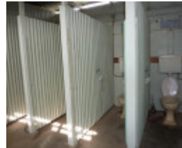
196487 f RAAF Base & Migrant Centre Benalla May 2015.JPG