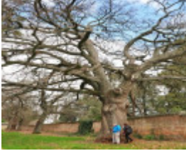
T12216 Quercus robur