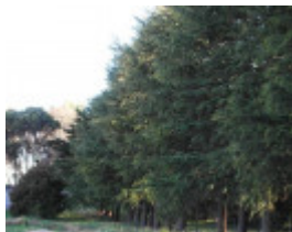
T12219 Quercus robur