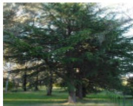
T12219 Quercus robur a