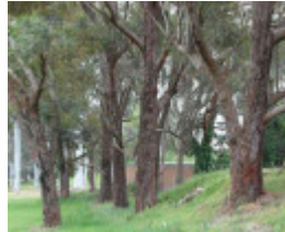
T12227 Eucalyptus c