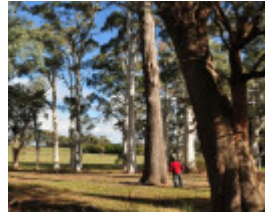
T12227 Eucalyptus b