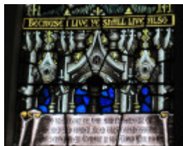
Hawthorn West Presbyterian [now Uniting] Church Second World War memorial inscription, Brooks Robinson & Co. 1947