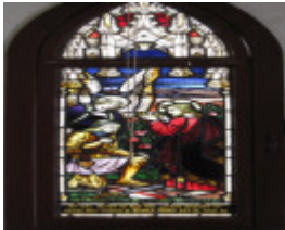
Kaniva Presbyterian Church Crown of Life BR&Co 1948 (1)