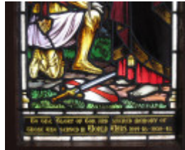
Kaniva Presbyterian Church Crown of Life BR&Co 1948 inscription