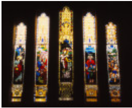
Armadale Presbyterian [now Uniting] Church, Good Samaritan, Derek Pearse inscription c1960