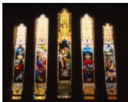
Armadale Presbyterian [now Uniting] Church, Good Samaritan, Derek Pearse inscription c1960