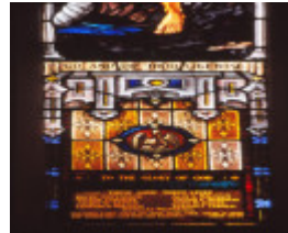
Armadale Presbyterian [now Uniting] Church, Good Samaritan, Derek Pearse inscription c1960