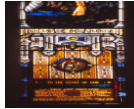
Armadale Presbyterian [now Uniting] Church, Good Samaritan, Derek Pearse inscription c1960