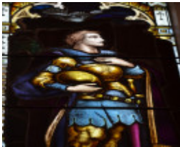
Armadale Uniting [former Methodist] Church, detail of Faithful Knight, First World War memorial, Brooks, Robinson & Co. 1921 WWI detail