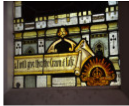
Armadale Uniting [former Methodist] Church, detail of text ribbon, First World War memorial, Brooks, Robinson & Co. 1921