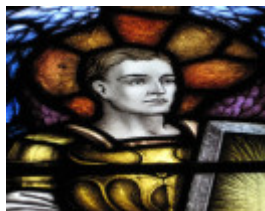
Castlemaine Uniting Church