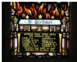
Castlemaine Uniting Church