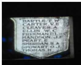
Castlemaine Uniting Church