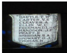
Castlemaine Uniting Church