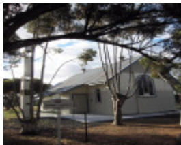
Yanac Uniting Church