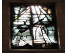
Derinallum All Saints Anglican