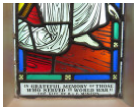
Sandringham All Souls Anglican Ferguson&Papas inscription