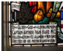
Ballarat Grammar School Chapel, Faithful Knight, inscription and AIF Badge, Mathieson & Gibson 1951