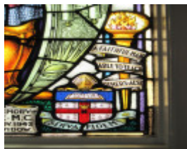
Ballarat Grammar School Chapel