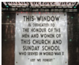
Burwood Uniting Church [formerly Methodist], plaque n.d.