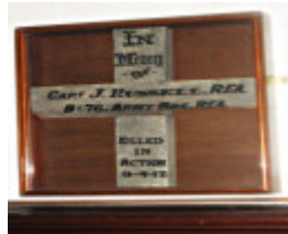
Snake Valley Carngham Uniting Church Russell cross