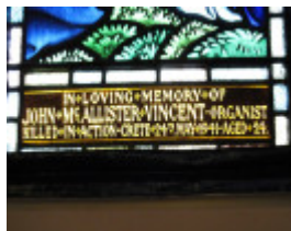
Brunswick Christ Church Anglican Jesu Joy inscription, Mathieson & Gibson cartoon, made by Brooks, Robinson & Co. 1952