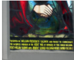
North Essendon Christ Church Anglican Ascension