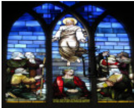
North Essendon Christ Church Anglican Ascension