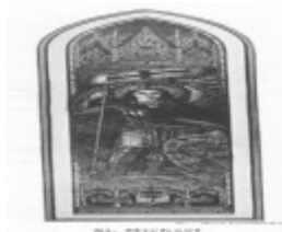
South Yarra Chr Church St Michael watercolour