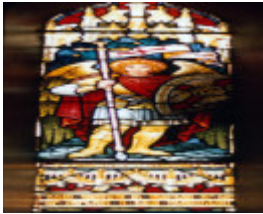
Melton Chr Church St Michael 1904