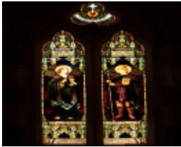
Christ Church Anglican St John St Alban