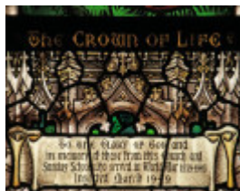
Newtown Geelong Pakington Methodist Crown of Life inscription 1949