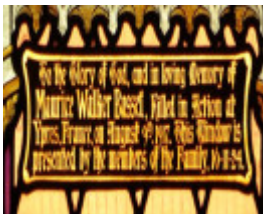
East Laen Bacchus Marsh Basset inscription