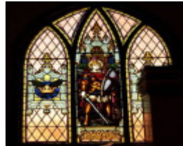
East Laen Bacchus Marsh Basset