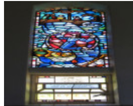
Crib Point HMAS Cerberus Anglican Chapel Jonah detail (1)