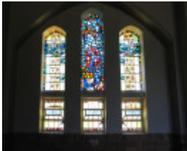
Crib Point HMAS Cerberus Anglican Chapel Jonah