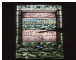
Corio Geelong Grammar School Lindon