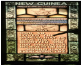
Corio GGS New Guinea Learmonth (1)