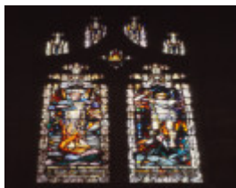
Corio Geelong Grammar School Chapel_ Michael and Uriel