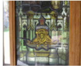
Robinvale St Peter's Anglican Church, formerly at Ultima, Ascension detail of artillery badge, Brooks, Robinson & Co., 1926