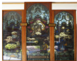
Robinvale St Peter's Anglican Church, formerly at Ultima, Ascension, Brooks, Robinson & Co., 1926