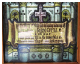
Robinvale St Peter's Anglican Church, formerly at Ultima, Ascension inscription, Brooks, Robinson & Co., 1926