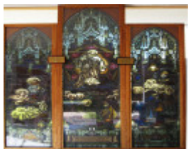
Robinvale St Peter's Anglican Church, formerly at Ultima, Ascension, Brooks, Robinson & Co., 1926