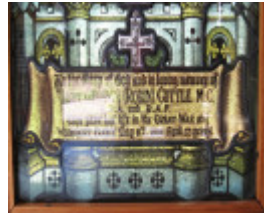
Robinvale St Peter's Anglican Church, formerly at Ultima, Ascension inscription, Brooks, Robinson & Co., 1926