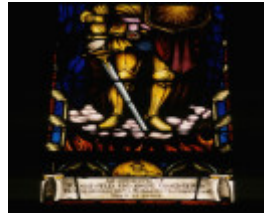
Oakleigh St Michael detail