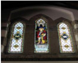
Doncaster Holy Trinity Anglican (2)