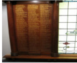
Horsham RSL WM