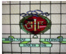
Horsham RSL WM