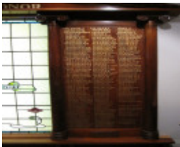
Horsham RSL WM