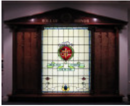
Horsham RSL WM