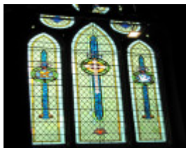
Prahran Independent Church 1928 (1)