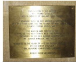
Ivanhoe Grammar School Chapel WWII plaque 2001