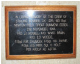
Ivanhoe Grammar School Chapel WWII RAF plaque 2001