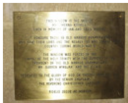
Ivanhoe Grammar School Chapel WWII plaque 2001