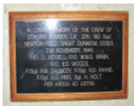
Ivanhoe Grammar School Chapel WWII RAF plaque 2001