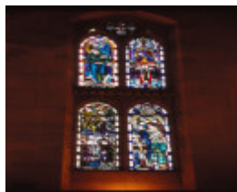
South Yarra Melbourne Grammar Chapel _0003