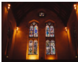
South Yarra Melbourne Grammar Chapel _0001